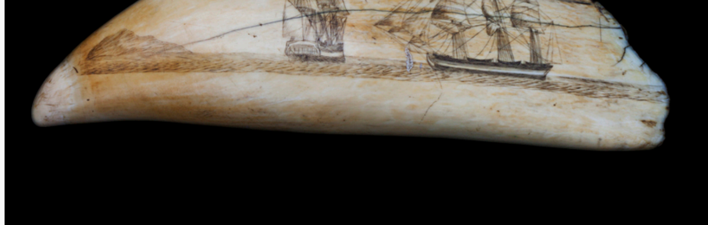
Image: Engraved whaletooth, ship George Clinton of Hudson, 1835 Gift of the Friends of the Nantucket Historical Society

The most important thing to know about the City of Hudson's connection to the whaling industry is that NO, whales do not swim up the Hudson River. Once you have that fact tucked under your belt, prepare yourself to learn so much more about how and why whales and the city share a deep, rich history.